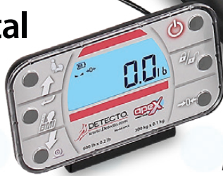
DETECTO Model APEX-RI

These digital flat scales let the patient weighing come to you!